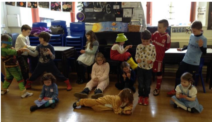
The Enormous Sneeze